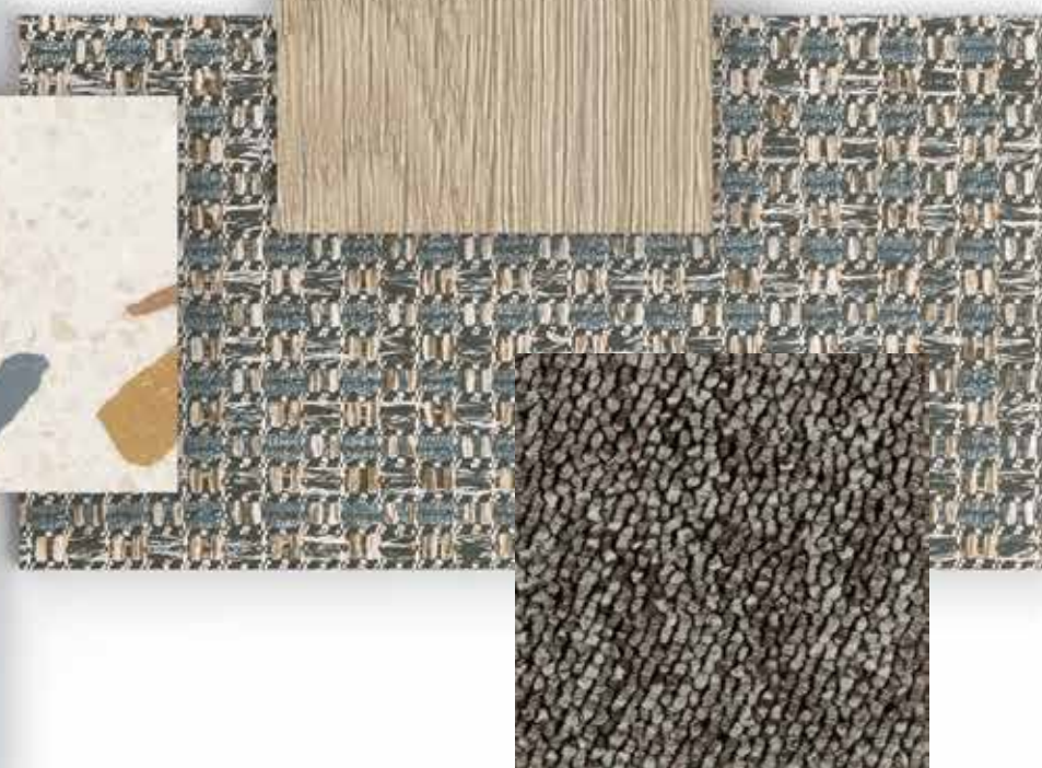
6501 Beige LRV : 35.0 /NCS : 7008-Y80R