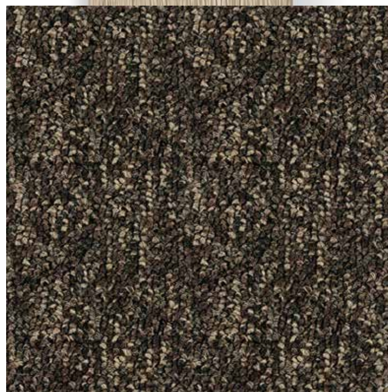
7801 Cacao LRV : 41.4 /NCS : 8005-Y80R