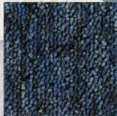
1801 Indigo LRV : 45.3 /NCS : 7020-R80B