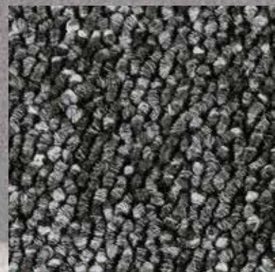
9701 Titanio LRV : 37.4 /NCS : 8500-N